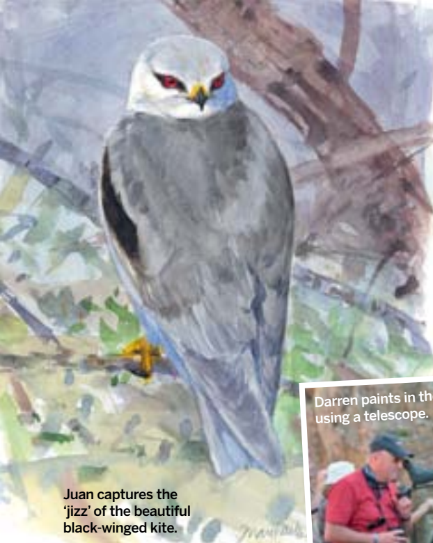
Juan captures the 'jizz' of the beautiful black-winged kite.